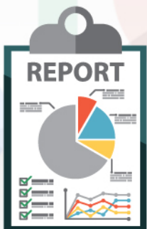
Old Google Reports