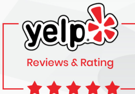
Old Yelp Reviews & Rating